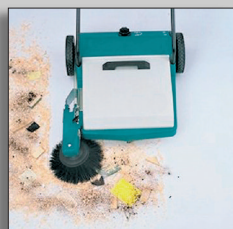
Side brush pushes dirt into the main sweeping brush path