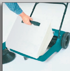
Easy hopper emptying