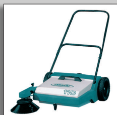
Side brush can be raised up