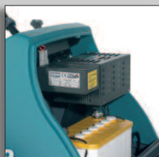
Standard on board charger