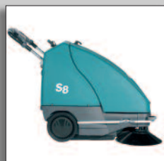
Strong roto-moulded covers