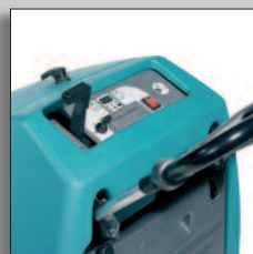
Easy to operate