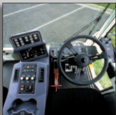
All sweeping functions within easy reach